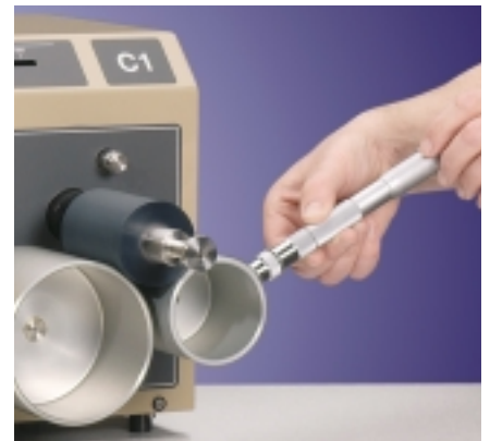
Applying ink with the IGT ink pipette

The distribution of the ink only takes about 30 seconds thanks to the diameter ratio and the oscillating drum movement. The inking time of the printing disc is about 15 seconds.