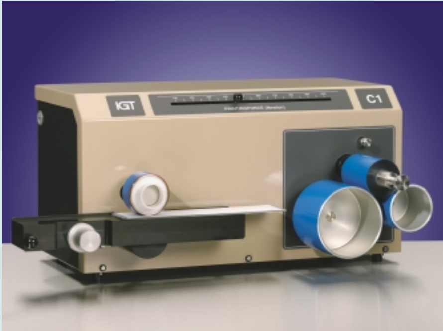
Making a print

Paper, board, plastic film, cellophane, laminate, metals, etc.