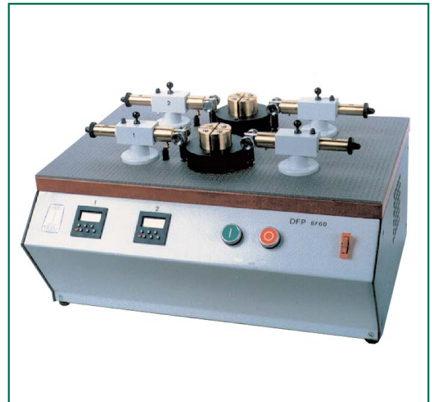
Model DFP 6/60