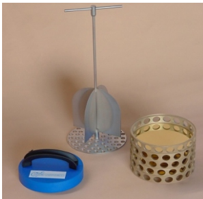
Standard manual mixer, couching weight and drying disc & rings

This equipment became a standard for Q.C. (quality control) and R&D (research and development) due to its sturdiness, precision, reliability and repeatability.