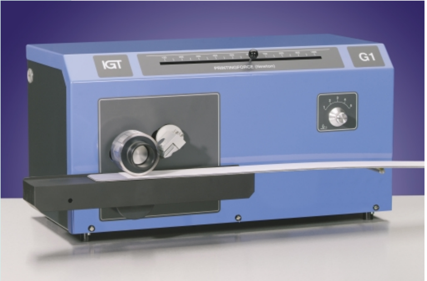
The G1-5, ready for use