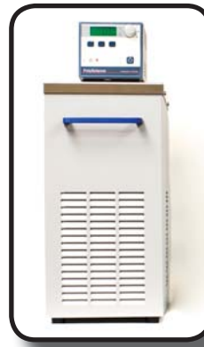
▲ Constant Temperature Circulator (CTC)