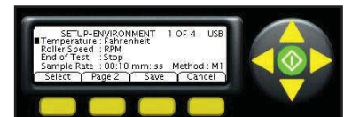
◀ Sample Menu Setups