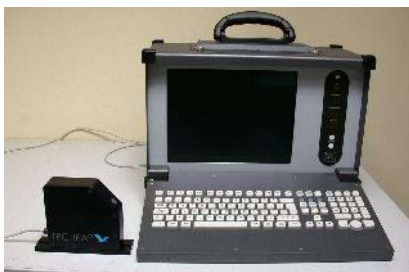
System with a portable PC

These values are calculated with an accuracy of 1/100 mm. The PC displays also average values, statistic data, tolerance - threshold overpassing. For each measurement it is possible to save, to load or consult a file