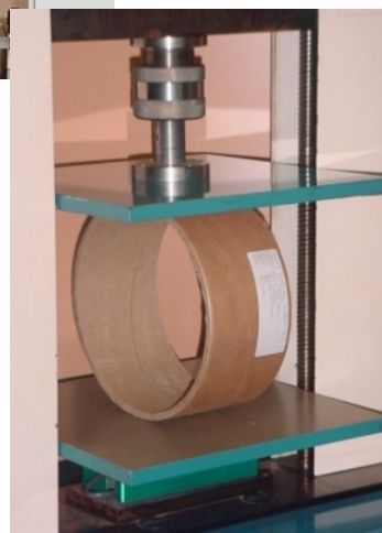
Core compression Applicable standards: ISO 11093-9