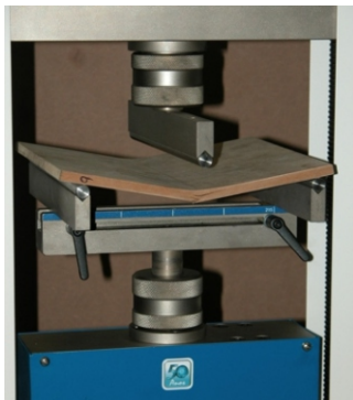
Deflection of MDF boards