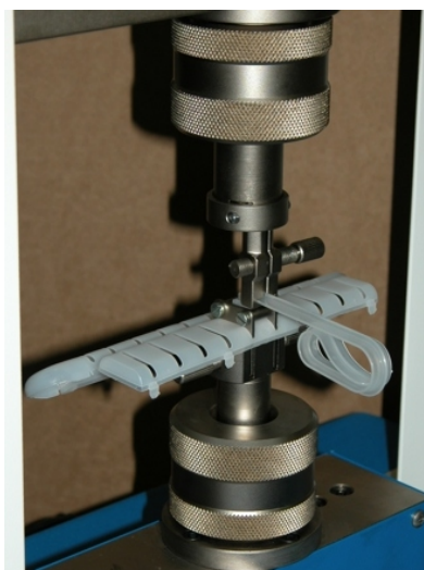
Rupture of plastics packing