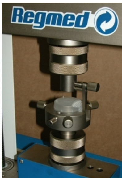
Opening resistance of flip-top fitting