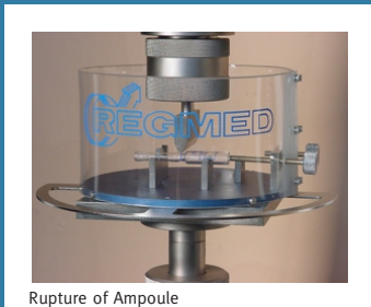
Rupture of Ampoule

They're always supplied with standard threaded connectors which ensure quick and easy exchange of devices.