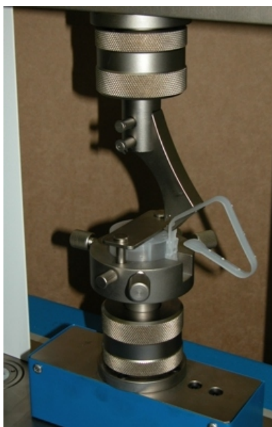
Extraction of plastic fitting