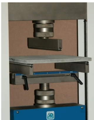
Deflection of plane cement boards