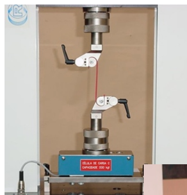
Rupture of wires