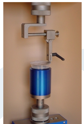
Peel opening force of cups and jars