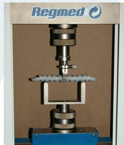
Special device for plastic pieces

Address: Av. Dr. Alberto Jackson Byington, 1595 CEP: 06276-000 - Osasco - SP - Brazil Phone: + 55 11 3601 5700 e-mail: regmed@regmed.com.br www.regmed.com.br