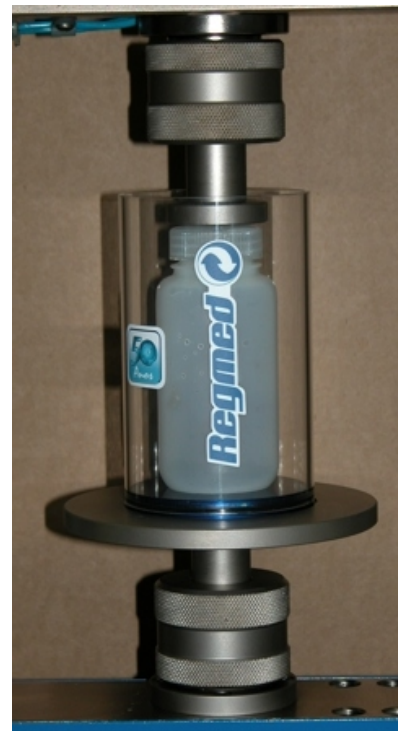
Compression of plastic bottles