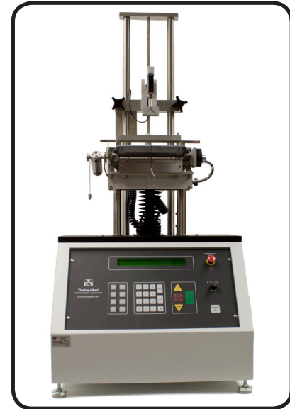
1270 PCA Score Bend shown with optional Bending Fixture