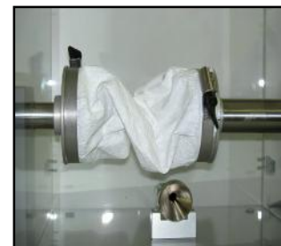
* EXAMPLE * Sample being tested